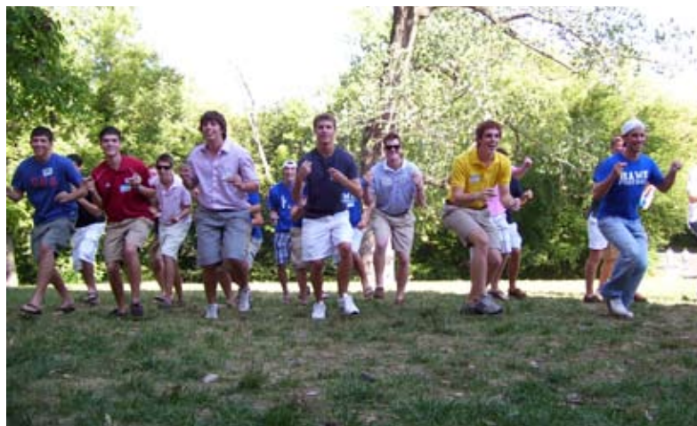
Pledges and Parents