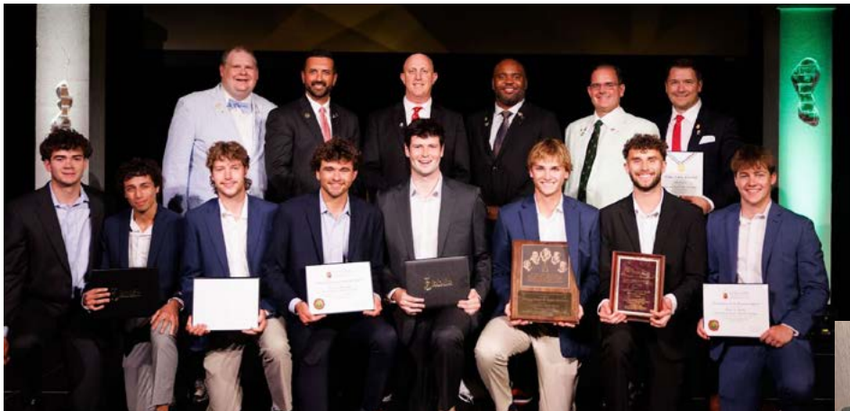
Collecting awards and recognition from the SEC at the annual banquet