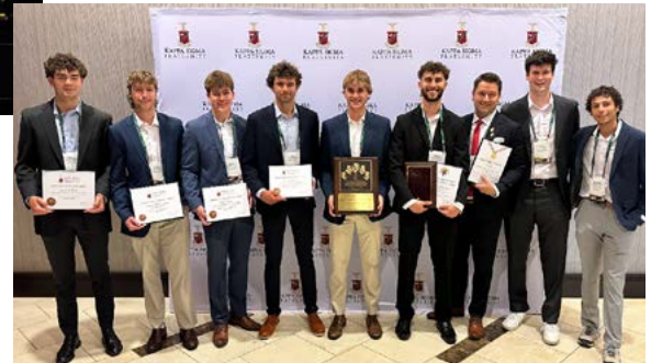
We need more hands for all this hardware!