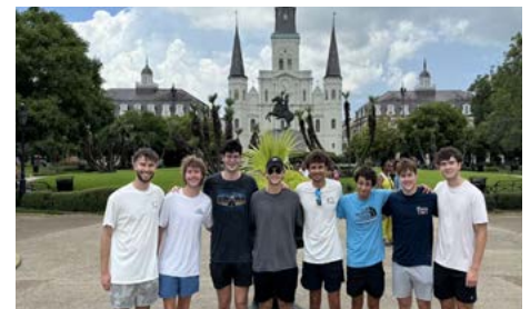
Our undergrads enjoying the sights in New Orleans