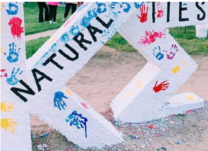
Upper Left: The chapter doing paintball in October 2019 Lower Left & Right: Hosting the Natural Ties Community Service event at the house